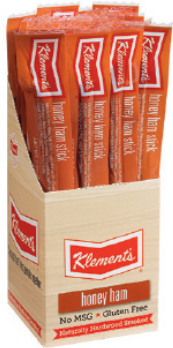
584265 Klements Honey Ham Stick Box 2/26 ct.