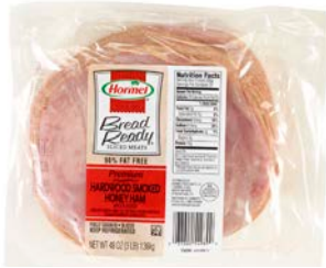
558726 Hormel Bread Ready Sliced Honey Ham 4/3 lb. avg.