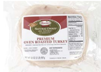
558740 Hormel Sliced Oven Roasted Turkey 6/2 lb. 1 oz.