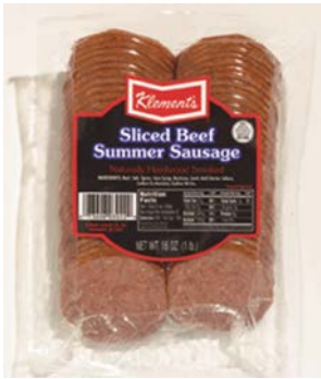
552758 Klements Deli Sliced Beef Summer Sausage 10/1 lb.

• FAMILY-OWNED AND OPERATED • UPPER LAKES FOODS EST 1967 ULF CORNER STORE: MEAT