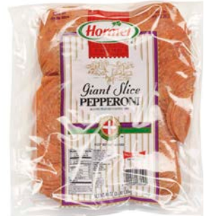
590974 Hormel Pillow Packed Sliced Pepperoni 4/3 lb. 8 oz.