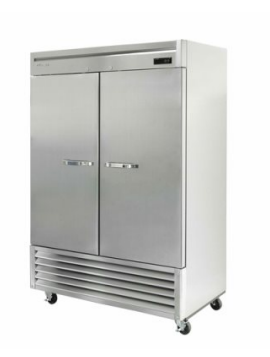
Tax is not included